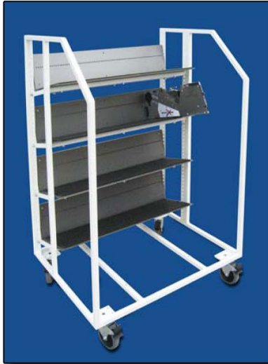
ASMP T 206 Feeder Storage Cart

ASMP T E by SIPLACE & X SERIES FEEDER STORAGE CARTS