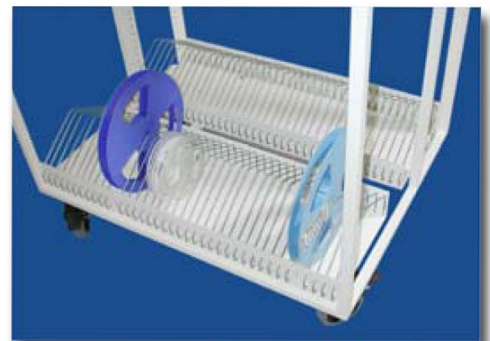
Optional Reel Storage