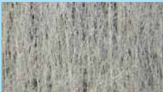
SMT non-woven fabric